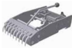
LION bacon gripper hook.